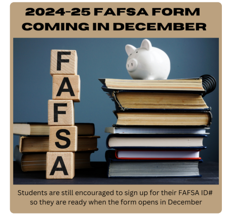
FAFSA - stay tuned! The FAFSA form will be available in December this year

To review the requirements and start your application visit: <u>https://ruddfoundation.org/how</u> <u>-to-apply</u>